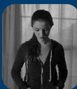
- Anonymous Local Community Member

United Way was not my first call for help, but it was the call that got me the help I needed.